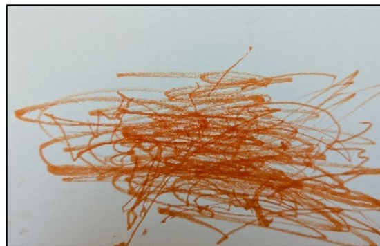
I like goldfish snacks at Quaker Meeting.