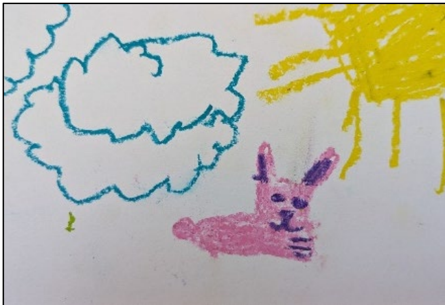
I like bunnies. And I liked Advent Garden. And I liked playing with my friends..