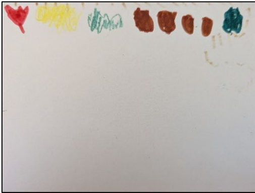
I liked making candles and my friends.

Children in First Day School illustrated their responses to the query with pictures of Advent Garden, candles, and snacks.