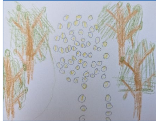
I liked doing the Advent Garden with all the candles.