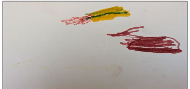
I drew a candle because it was fun to make them at Advent Garden.