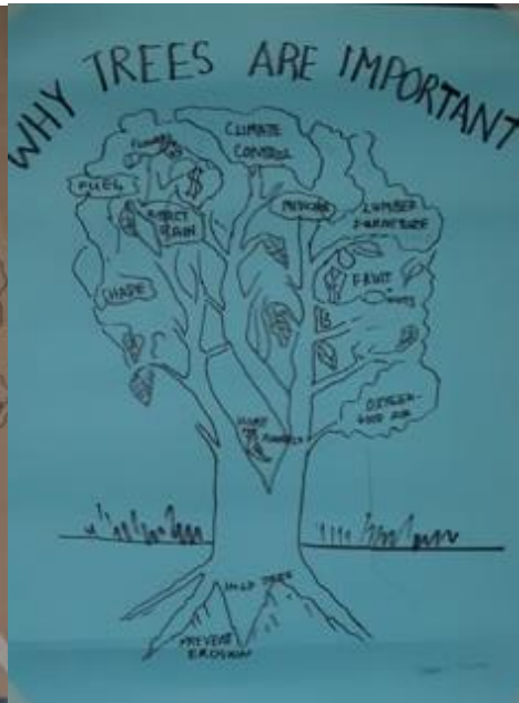
girls poster, a mango tree