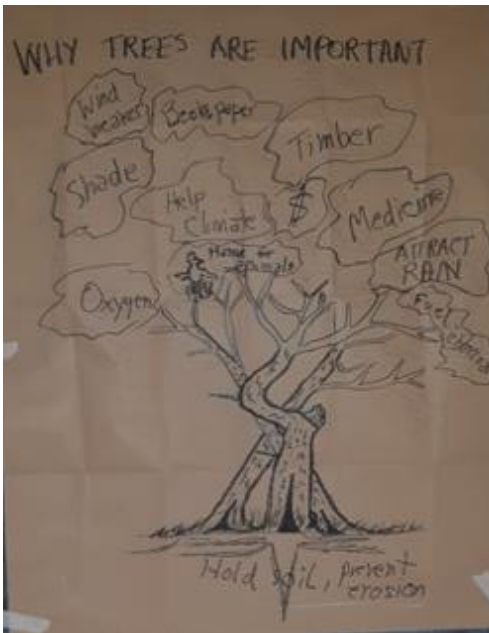
Original poster, (a double acacia tree