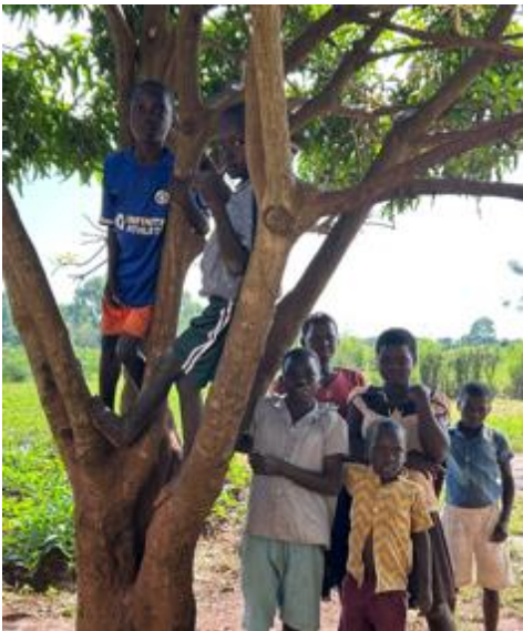
Kids enjoying a tree