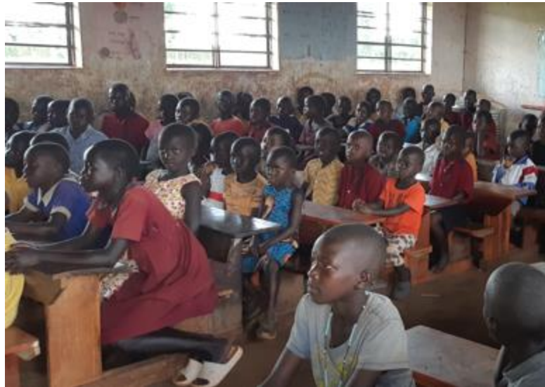
Part of the kids I was teaching about the importance of trees.