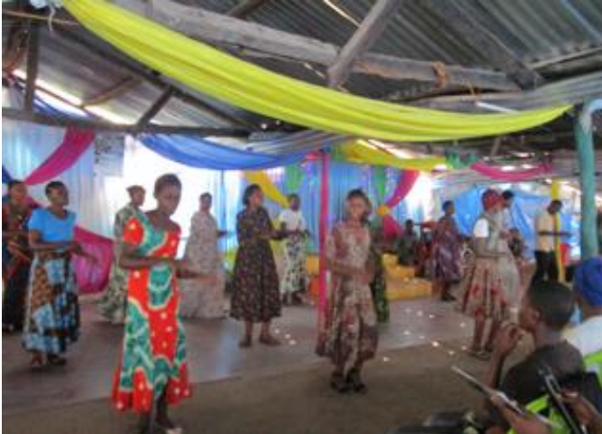
Dorcas speaking to the women